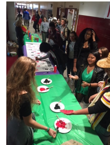
Photos from the AP Studio Art Encaustics workshop on October 24th at R&F Paint in Kingston